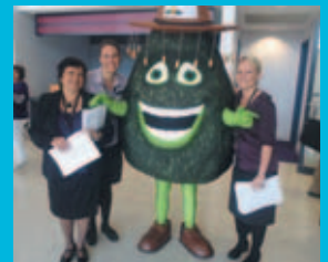
Cairns Convention Centre Event Team members with Alvin the Avocado

"We had such a huge success with the conference in Cairns because of the way the convention centre and the hotels in Cairns operated and the close proximity of the Tablelands for the field day. The north was the only location we could have staged it - and it came off with a bang."